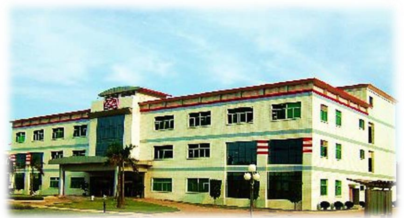
Branch and plant in Guangdong, China