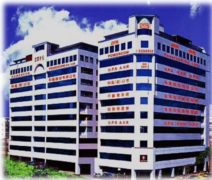
Real View of POWERCOM Headquarter and Plant in Taiwan

POWERCOM adheres to the customer-centric service spirit, consolidate good partnerships in the supply chain, provide customers with complete power solutions, and move toward a world-class brand!