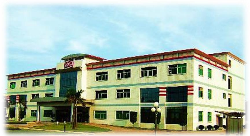
Branch and plant in Guangdong, China