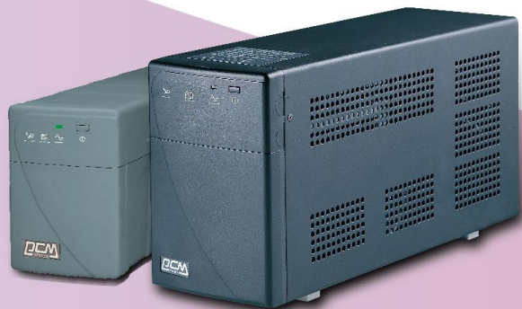
Black Knight 黑武士系列