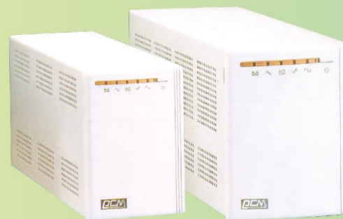
KING Series 王牌系列