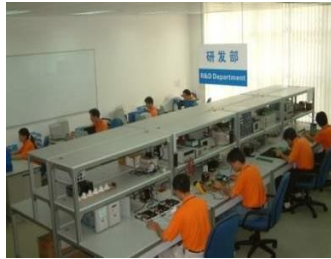
PCB Design & Layout